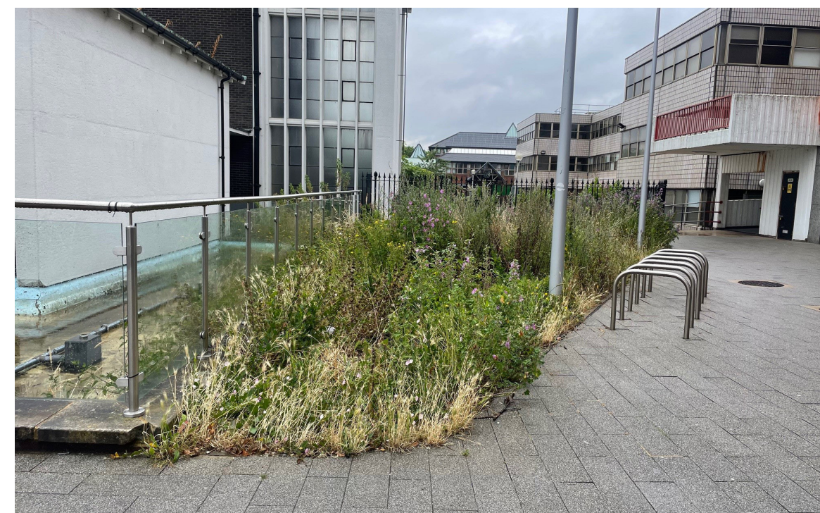
Photos of existing planting beds and planters in St Martin's Square & East Square