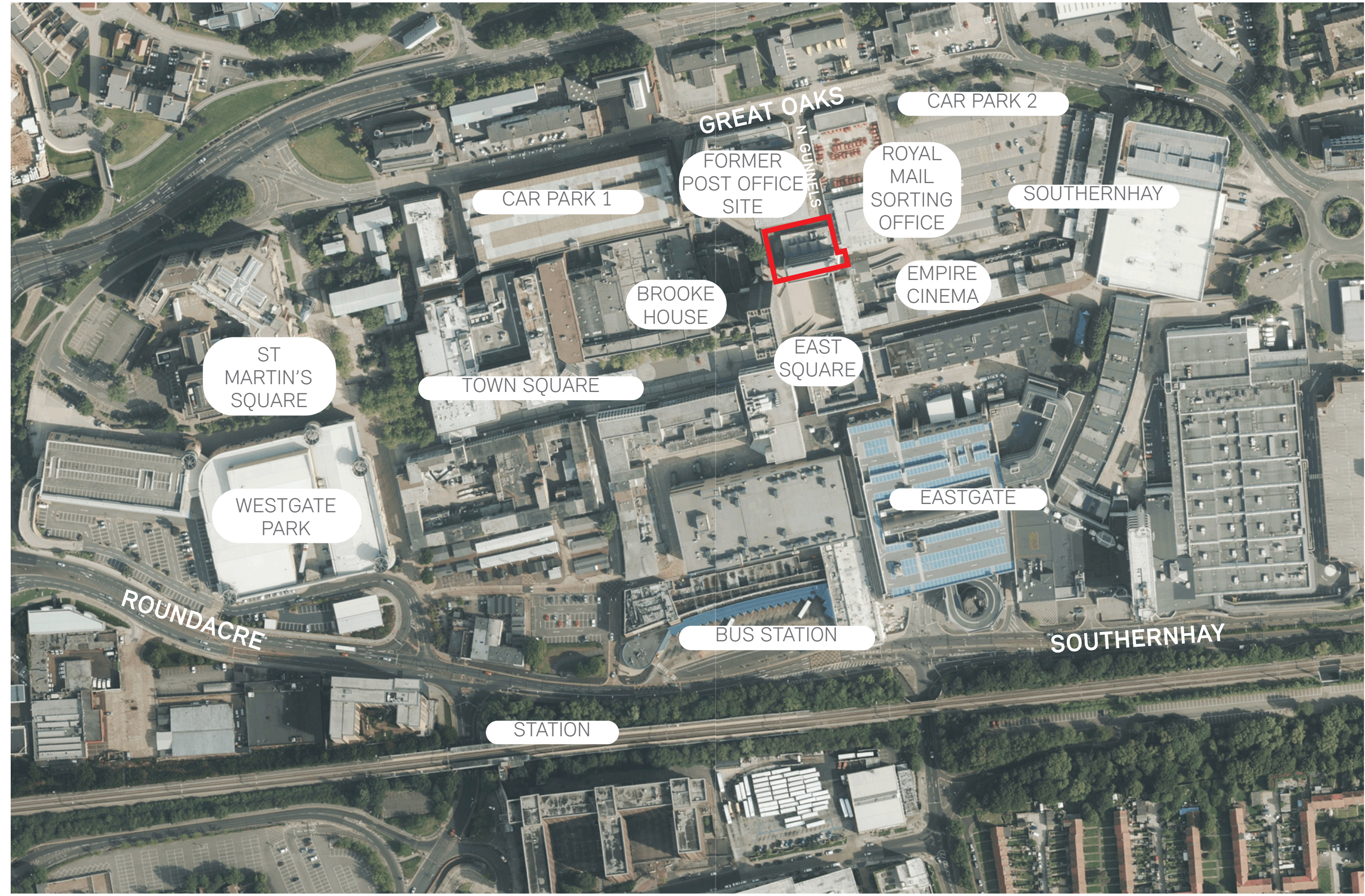
We are delighted to share with you today the proposals for the former post office site in Basildon town centre. This project builds on the Council's broader regeneration objectives, delivering new homes and improvements to the town centre to make Basildon a destination of choice. Our first public event showed early proposals in August 2021. Today we share updated designs to be submitted for planning permission in Spring 2023.

A birds eye view of the town centre, showing East Square and the surrounding context