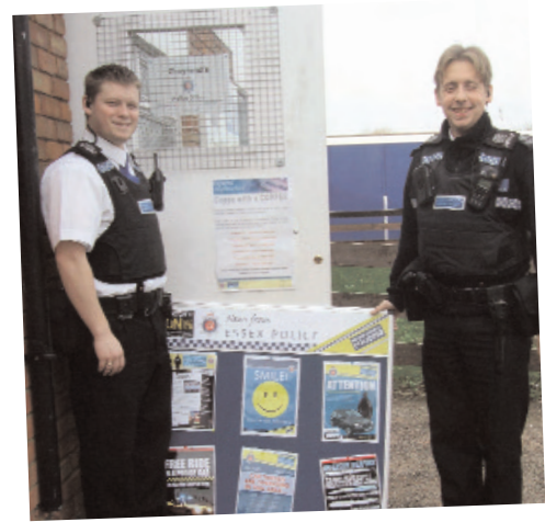
Neighbourhood Police Team hold Crime surgeries and Neighbourhood Action Plan meetings in the Consultation Shop in Exeter Close