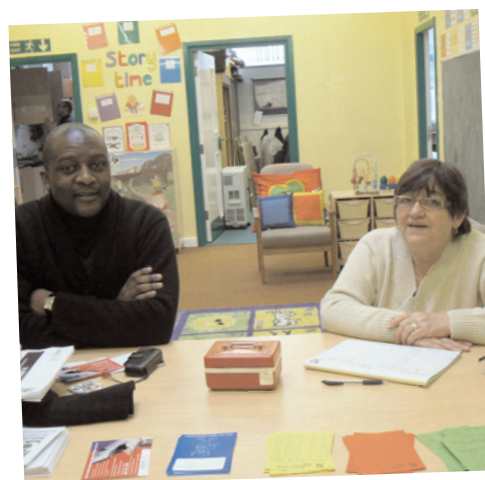
Credit Union opens at Fryerns Farm Childrens Centre. Come along and find out how a Credit Union works and how it can support you.