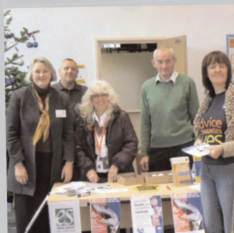
CAB and Credit Union working together to promote the advantages of joining the credit union, money advice and support.