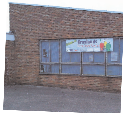
Swan and Friends of Craylands have successfully opened the Craylands Internet Cafe