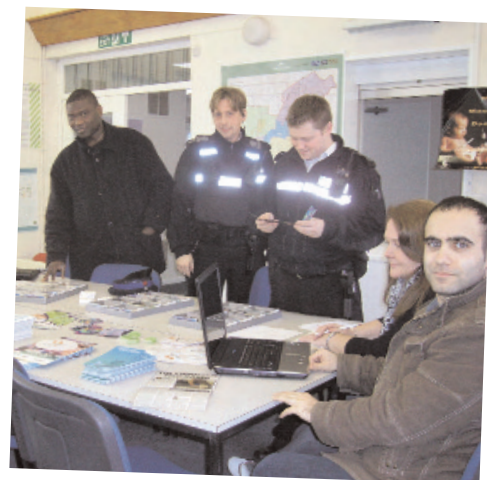
Drug and alcohol awareness sessions were arranged in the consultation shop.