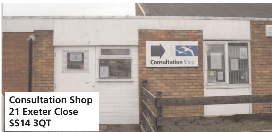
Consultation Shop 21 Exeter Close SS14 3QT