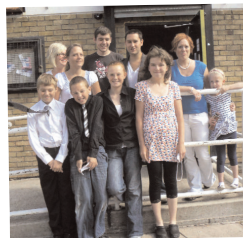
Young people of Craylands and the Trinity Mind Body & Soul theatre group work together to engage with local residents.