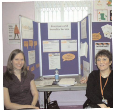
Health MOT - Providing info on issues that may cause ill health such as money worries, eating the right food, smoking, alcohol and substance misuse.