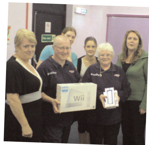
Friends of Craylands are a group of residents who hold community activities and support residents with a variety of issues