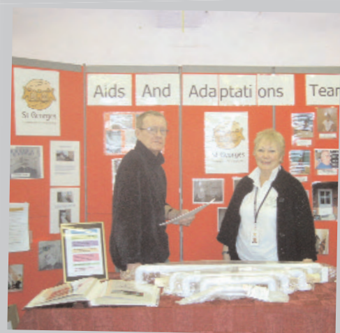
Aids & adaptations help elderly & disabled tenants to continue living independently in their own home by SGCH