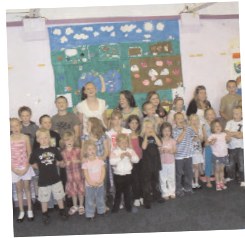
Craylands Activity Zone arrange Arts, crafts and Sports activities during school holidays