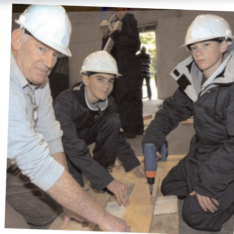
Young people having an opportunity to learn new skills at the Basildon Trade School