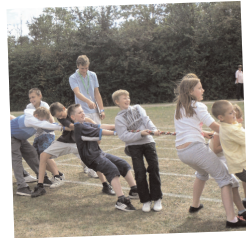
old fashioned sports day Local children and their families participating in family learning activities.