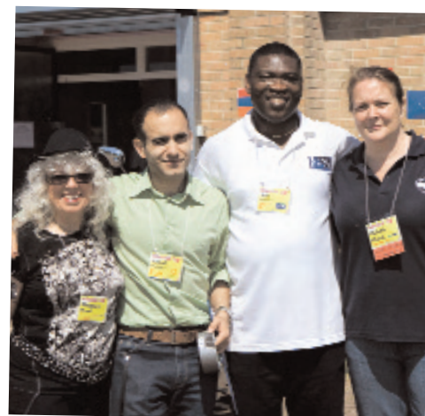
Annual International Day event at Frypa Hall: an opportunity to celebrate the diversity of cultures through food, fun events and dance.