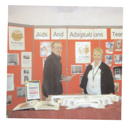
Aids & adaptations help elderly & disabled tenants to continue living independently in their own home by SGCH