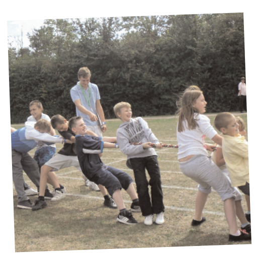
old fashioned sports day Local children and their families participating in family learning activities.