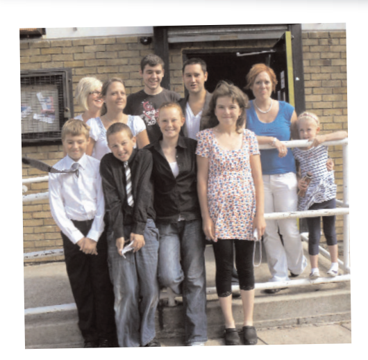
Young people of craylands and the Trinity Mind Body & Soul theatre group work together to engage with local residents.