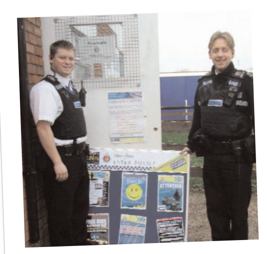
Neighbourhood Police Team hold crime surgeries and Neighbourhood Action Plan meetings in the Consultation Shop in Exeter Close