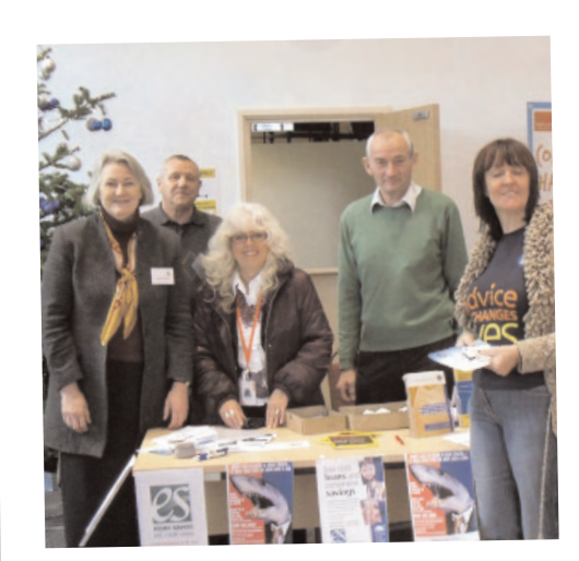
CAB and credit Union working together to promote the advantages of joining the credit union, money advice and support.