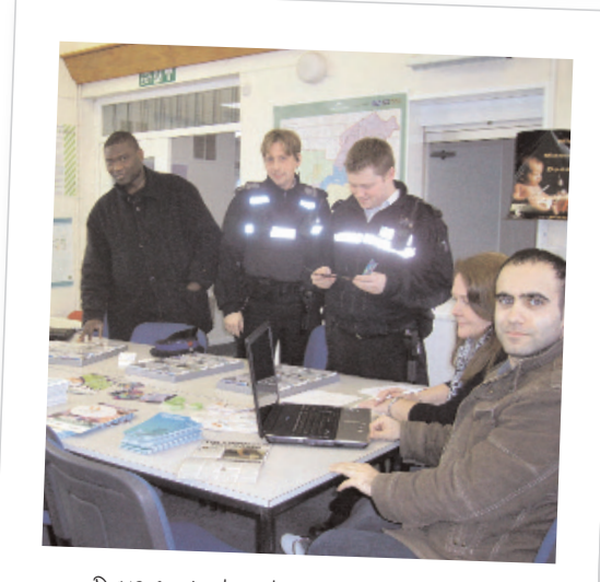
Drug and alcohol awareness sessions were arranged in the consultation shop.