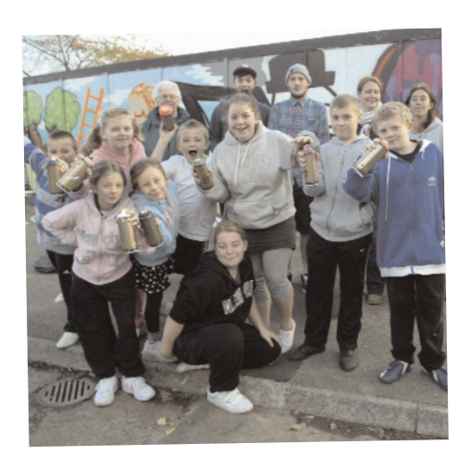
A 3 week course to design and paint this colourful community art project on hoardings around the new development site.