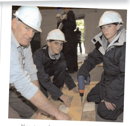
Young people having an opportunity to learn new skills at the Basildon Trade School