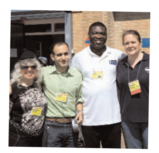
Annual International Day event at Frypa Hall: an opportunity to celebrate the diversity of cultures through food, fun events and dance.